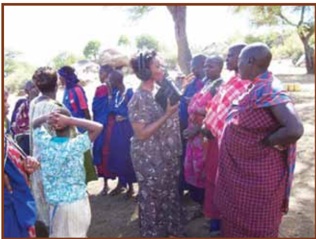
Community radio discussion programme in Kimanjiro

Moshi FGM Radio estimates that more than 5 million people have been reached through the radio messages, which are aired in the areas of Kilimanjaro, Arusha, Manyara, Tanga and even heard in parts of Kenya.