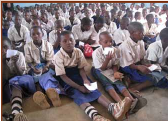
Girls from Simanjiro being empowered to say NO to FGM

The children are also encouraged to produce songs, sketches, and poems that highlight the effects of FGM. These are subsequently used to educate their peers and communities about the problems associated with the practice.