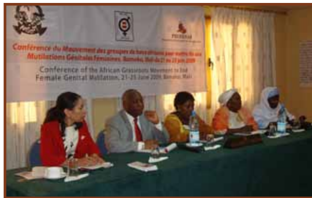
Sixth Annual Meeting of the Fund for Grassroots Activism to End Female Genital Mutilation, held in June 2009, Bamako, Mali

and local authorities on the legal enforcement on FGM, the Fund has enabled local activists to innovate and implement local interventions on eliminating FGM that are appropriate to their socio-cultural context.