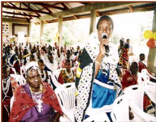
An 'ex-circumciser', from Simanjiro Manyara region, calling on all the children to say no to FGM