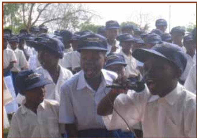
Students singing anti-FGM songs during a public procession in Simanjiro, Tanzania

The children are also encouraged to produce songs, sketches, and poems that highlight the effects of FGM. These are subsequently used to educate their peers and communities about the problems associated with the practice.