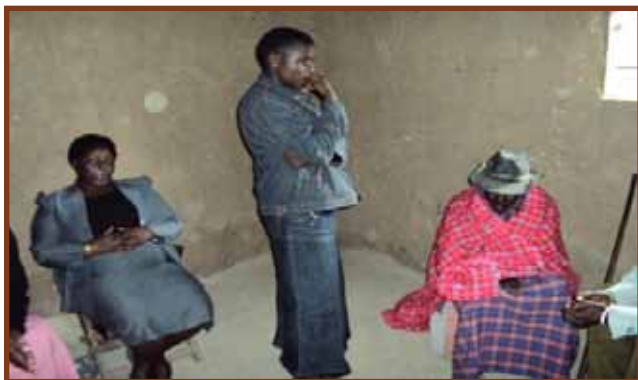
Girls being reconciled with their families

TNI organises reconciliation meetings between the girls and their parents with the aim of reuniting girls with their parents.