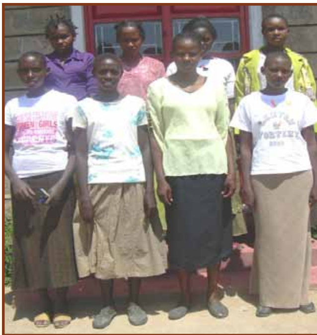
Rescued girls at the Tasaru Rescue Centre in Narok South

TNI provides temporary shelter to young girls who run away from FGM and early marriages in the Narok South and North districts of the Rift Valley province in Kenya. Its main objective is to ensure that girls who have been thrown out of their homes or run away as a result of saying 'No' to FGM and/or early marriage are sheltered and supported morally, socially and educationally, and are eventually returned to their families through a reconciliatory process.