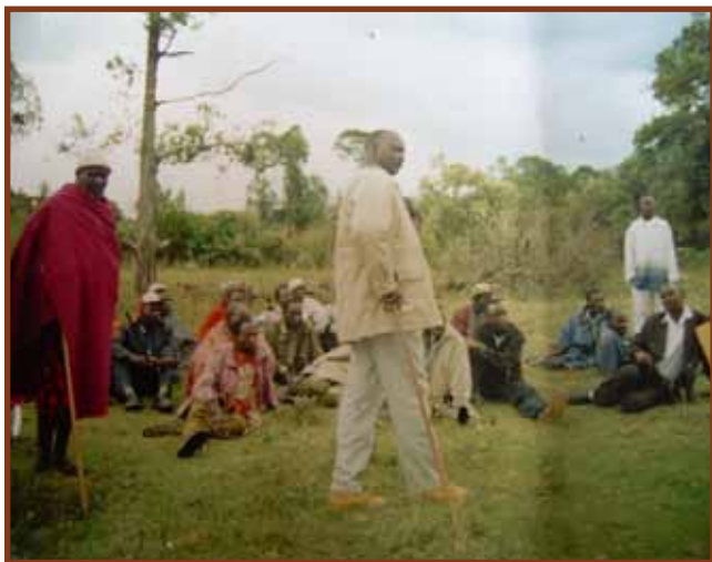
TNI Workshop with Maasai men

The Maasai community is male-dominated. Maasai women hold inferior positions with respect to power, decision-making and ownership of resources. As such, discussions between the sexes on FGM are rarely productive. Recognizing this, TNI holds separate seminars for women and men. This allows all participants to contribute and speak freely.